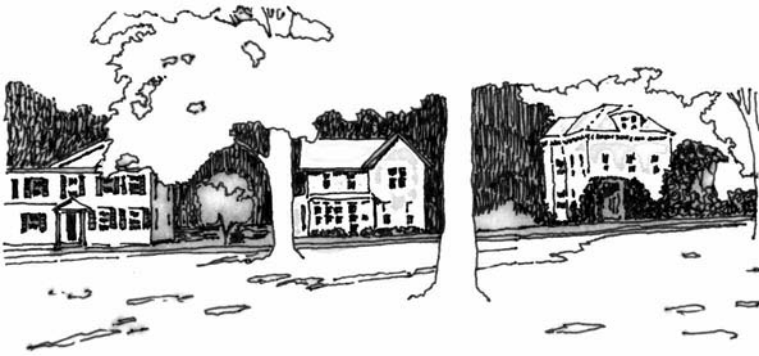
Village Green: Kingsville, Ashtabula County.

to the Midwest. A public place, usually in the village center, was often reserved for common use, undivided and owned by all. Sometimes it was only an expanded crossroads; more often it was made distinctive in some way. Trees were planted for ornament and shade. Under the trees, pathways crisscrossed a flat lawn and came out at streets on all sides. At the edges of the park, statues or cut stones carried inscriptions of dedication, remembrance, and inspiration. Across the streets and surrounding the park were the few other unique items in the village, buildings that focused the collective attentions of people on education, worship, or trade: the school, the church, and the general store.